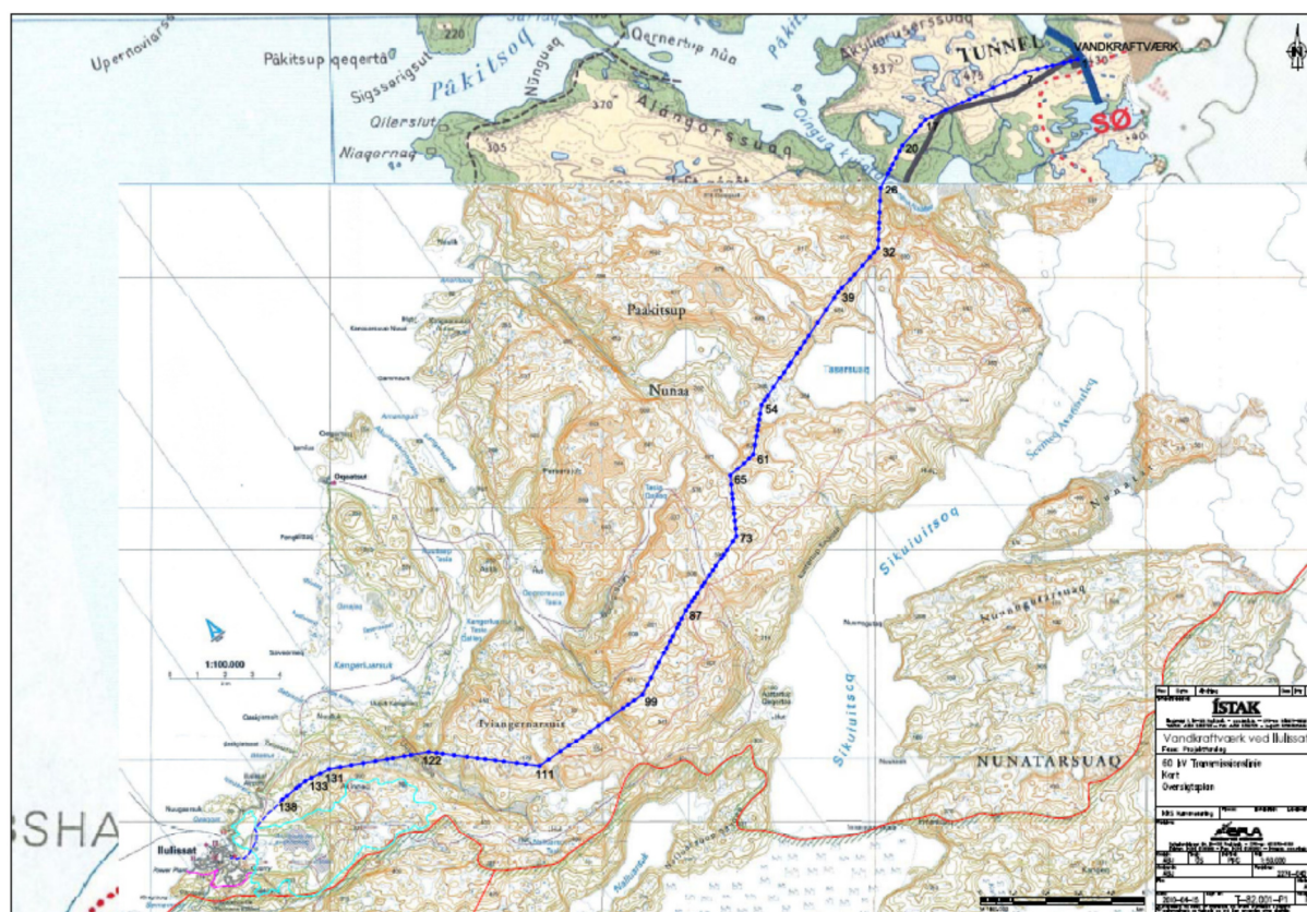
Map 1. This map made by ÍSTAK shows the transmission line and the position of the masts. A list of mast coordinates were also handed out to the NKA.